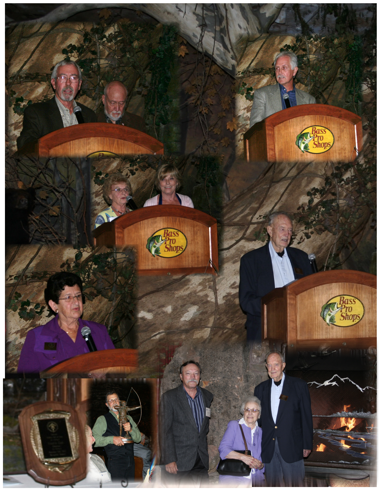
27^{th} Hall of Fame Induction 2012