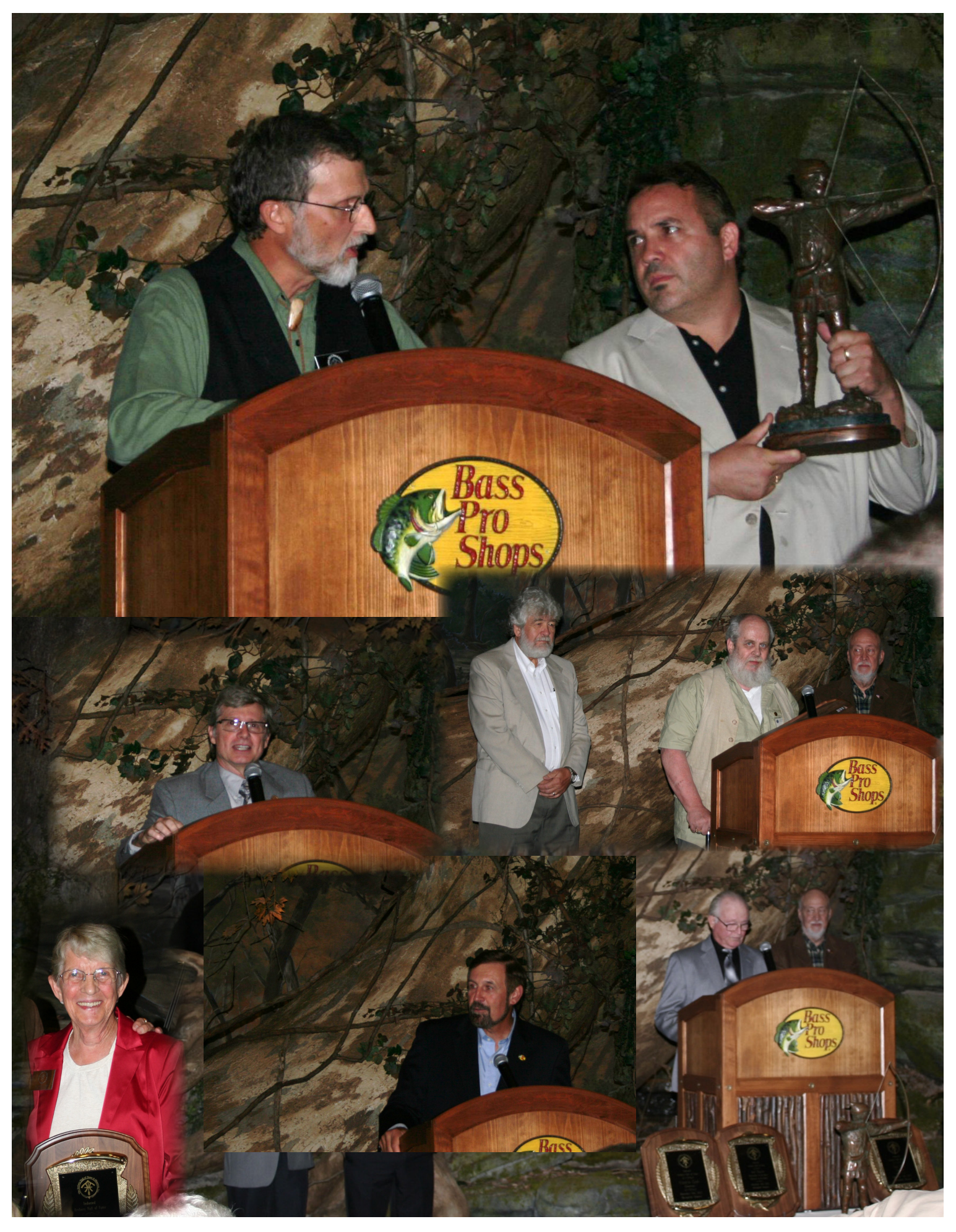
27^{th} Hall of Fame Induction 2012