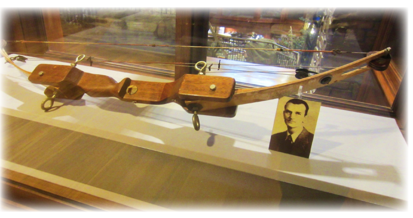
One of Holless Wilbur Allen's first Prototypes on display