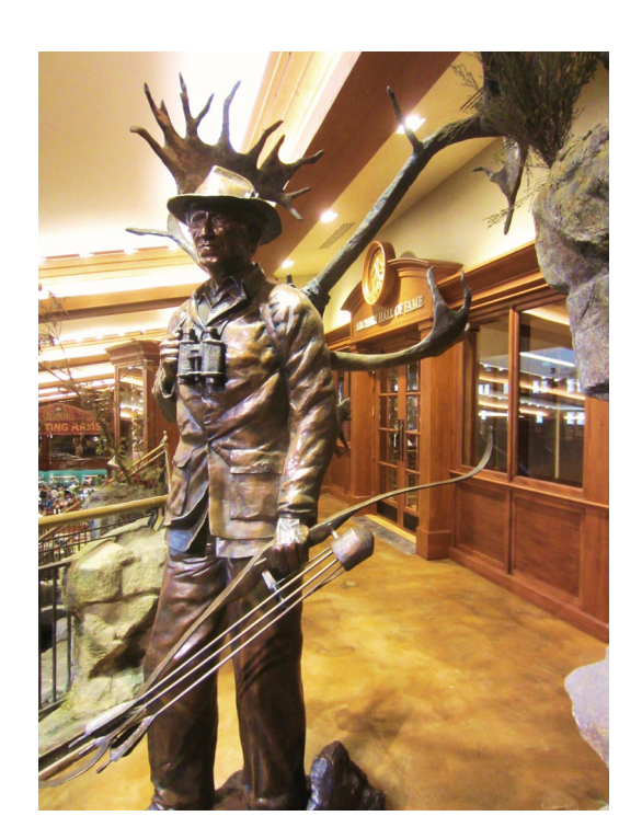
27th Hall of Fame Induction 2012

They came from near and far, some from as far away as Australia to be the first to witness the talked - about museum that has been decades in the making. As people made their way towards the museum, the first thing they saw was the large bronze statue of archery icon, Fred Bear. That was just a teaser of what was to come. Approaching the Museum doors a large AHoF logo is